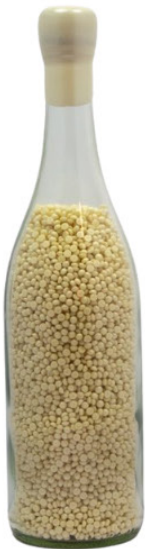
White Pearl *